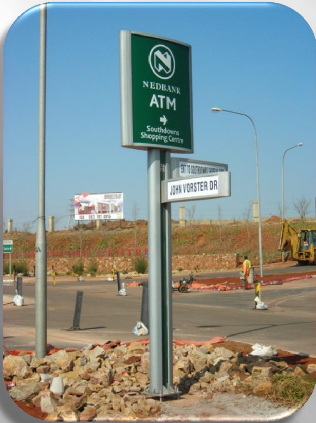
Illuminated street signage

"Creating revenue from existing infrastructure through advertising to improve future infrastructure"